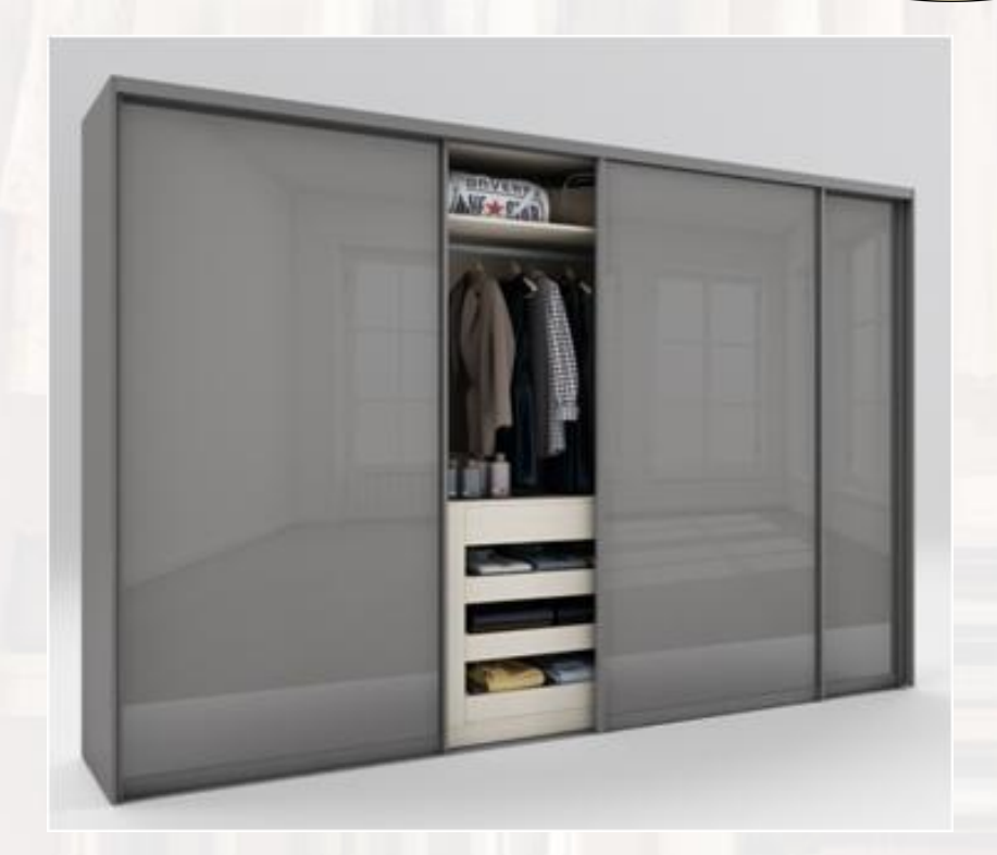
Gallery- single panel shutter