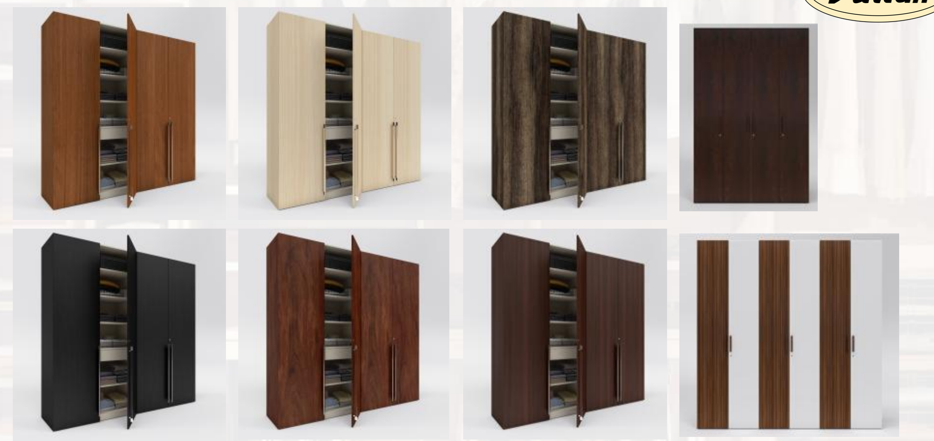
Gallery - Openable wardrobe