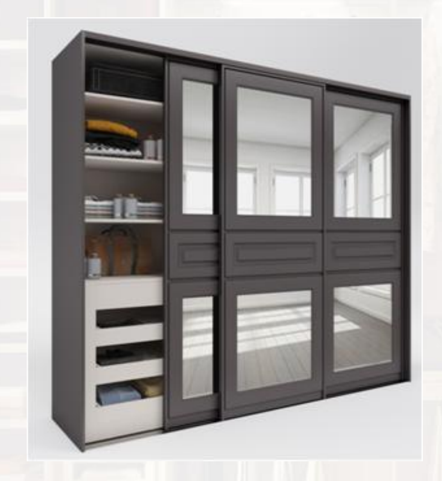
Gallery- Classical Shutter Design