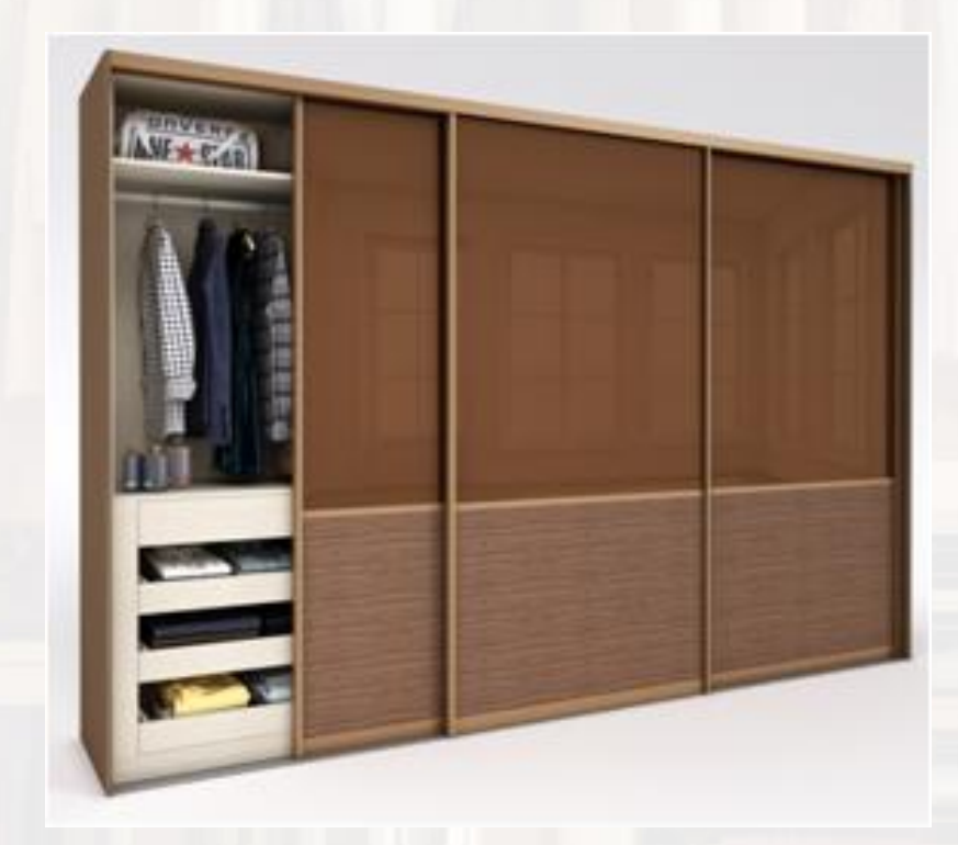
Gallery- 2 panel shutter